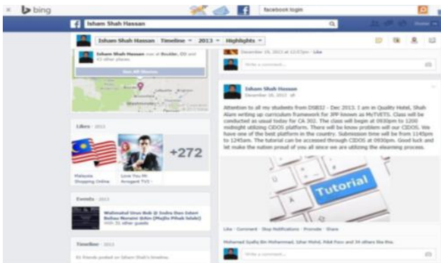
Fig 1-Sample upon however instruction on tutorial for digital modeling category being given to students via Facebook

During this article, we tend to utilize Facebook in each formal and casual training. Facebook is required as an instruction apparatus, yet in schools and universities limit or shut facebook are passing up an incredible chance to utilize person to person communication to move understudies to learn and share utilizing innovation in straightforward way and it is troublesome as learning device in education. As appeared in the figure 1. Casual instruction it being named official modules that understudies can enlist in Port Dickson tech. while casual instruction here alludes to learning outside class and in any event, learning outside Port Dickson tech field. Throughout this paper, we've a blend to supply samples of learning within and outdoors room mistreatment Facebook to speak in an exceedingly category, causing assignment, to share data in an exceedingly category, and mistreatment facebook to raise and questions about however produce digital model utilizing AutoCAD. In digital modeling category students received instruction for tutorials and quizzes mistreatment CiDOS (Curriculum data Document on-line System). They are also to speak with classmates and lecturer mistreatment Facebook. CiDOS could be a system being designed in technical school for storing notes, quizzes and tutorials for all the modules being offered in technical school.