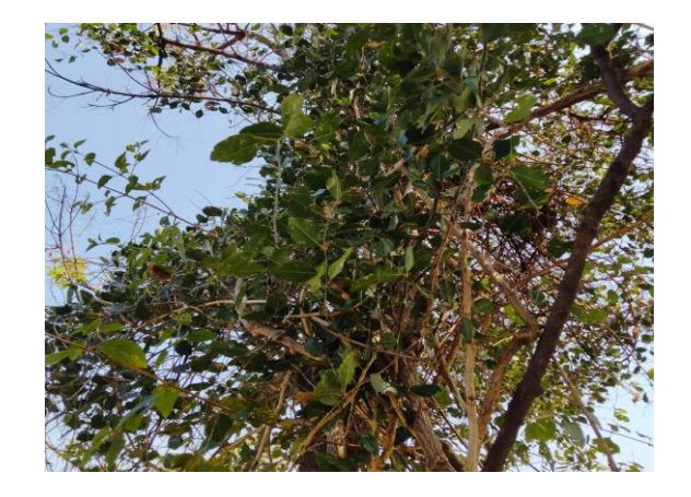
Fig 2.1 Cappers zeylanica linn leaves

ders are stored properly in an airtight container for future purpose.