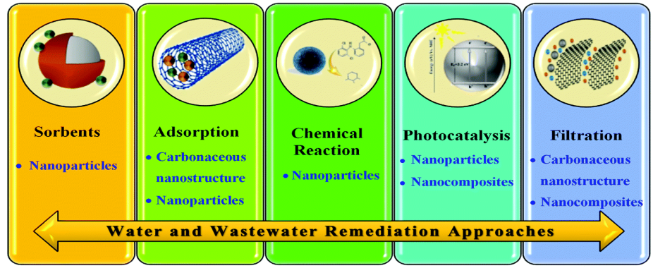
Figure 2: Different strategies of Wastewater Treatment