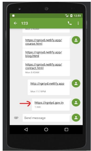
Fig. 5 Link with Different Host